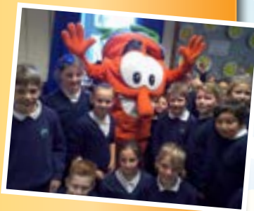
Photo shows Cowling CE pupils celebrating the launch of working towards the Food for Life school award with Herbie the Carrot. Pupils, staff and visitors enjoyed a delicious Roast Dinner using locally sourced, farm assured pork loin.

This has now been endorsed for the second year running by the Soil Association Food for Life - Bronze Catering Award who promote home produced, high quality, fresh food using local suppliers. We work very closely with our suppliers to ensure high standards, not only in food quality, but also safety and hygiene.